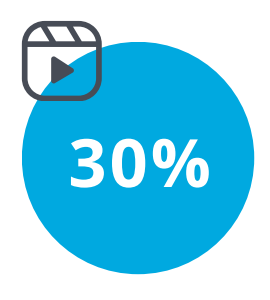
Increase in video library views