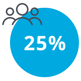
Increase in overall member retention