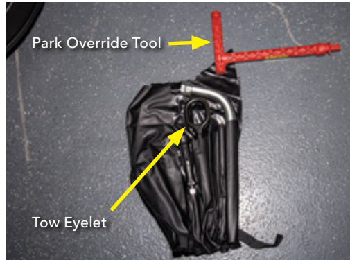
Tool Kit and Park Override Tool