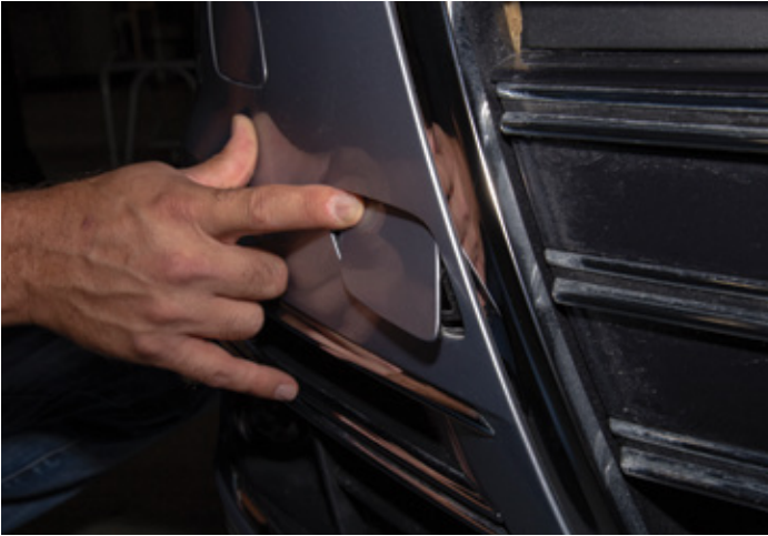
FRONT: Press the top of the front eyelet cover to remove.