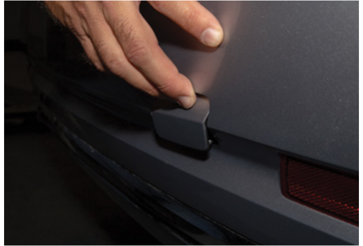
REAR: Press the top of the rear eyelet cover to remove.