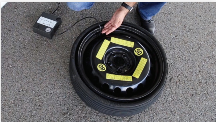
Connect the air line to valve stem. Plug in the compressor to the power point in the cargo area.