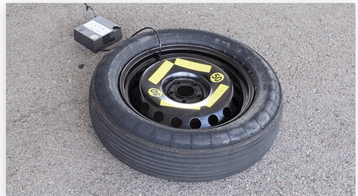
Fill the tire to the recommended tire pressure specification.