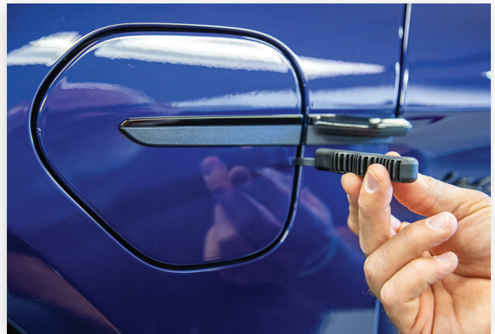
Insert the removal tool in the center of the rear side of the charge door.