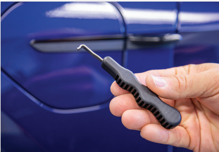
Charge door removal tool.

In the front trunk area, locate the tool kit on the driver side of the vehicle.