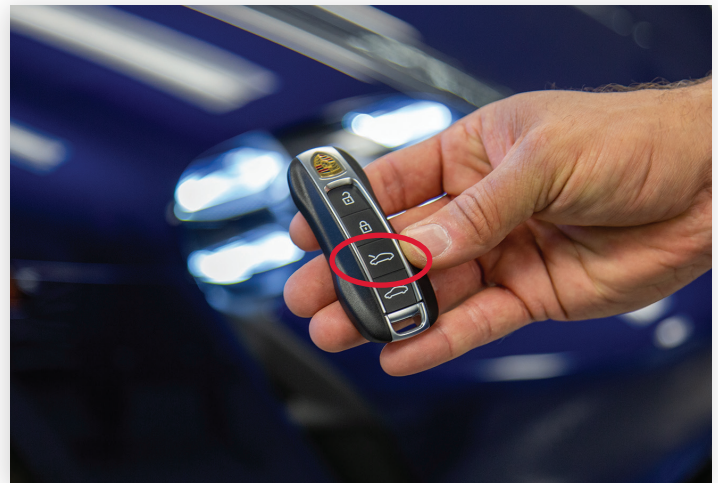
Use the key fob to open the front trunk.

Disconnect the 12-volt power source from the terminal in the fuse box and the door check.