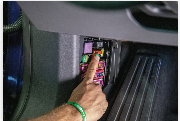
Pull out the red positive terminal. Make the 12-volt positive connection from the power source.