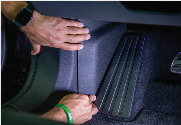
Remove the kick panel in the driver side footwell.