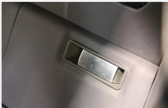
Hood release location, behind the driver's seat

Take the car immediately to the carrier and load for transport to the dealership. Before shutting off the engine, shift the car to neutral and set the parking brake.