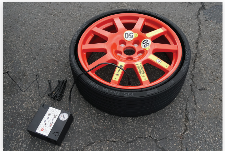
Connect the air line to the valve stem plug in the compressor to the power point in the cargo area.

The vehicle's ignition will need to be placed in the "ON" position to energize the 12-volt power point in the cargo area.