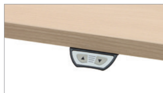
Up/Down User Interface