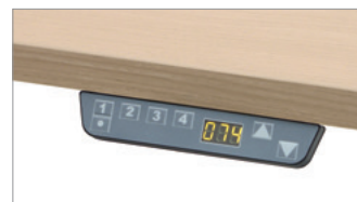
Programmable User Interface