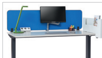
Screen on Desk