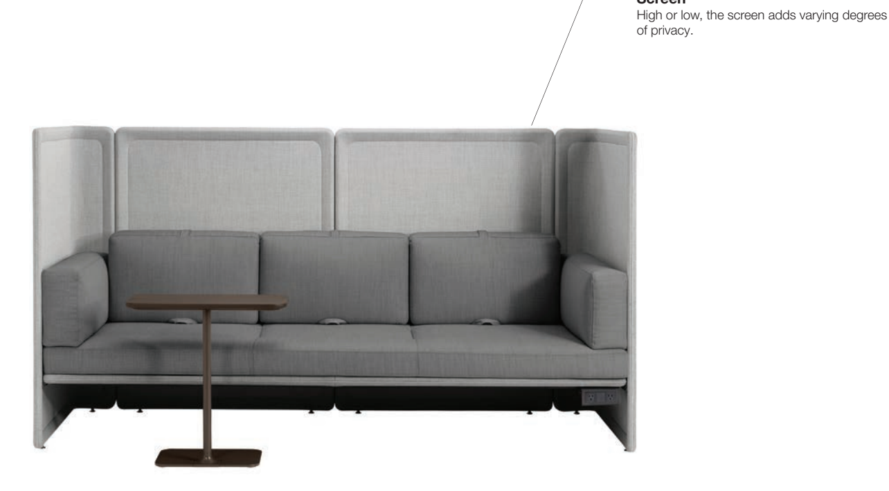
Lagunitas 3-Seat Lounge with Personal Table

From the conventional to the casual, Lagunitas adapts to changing workstyles and shifting work postures.