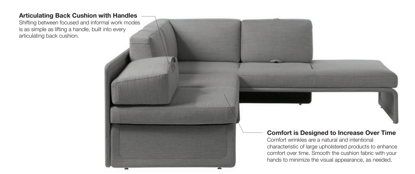
Lagunitas 3-Seat Chaise and 2-Seat Lounge