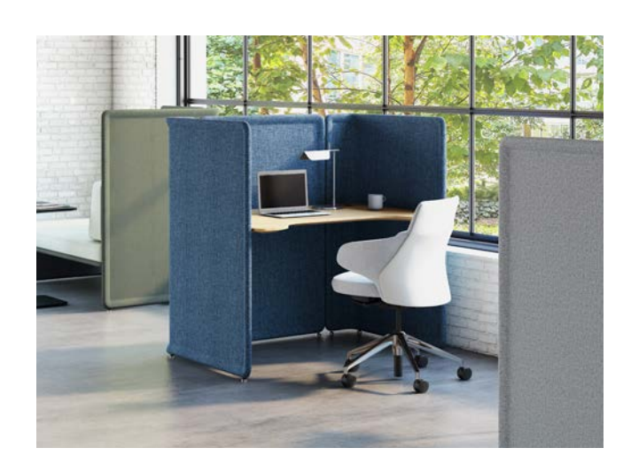
A touch-down destination for focused work. Lagunitas Focus Nook optimizes space within the open plan while allowing users to stay centered and free from distraction.

Space-defining. Working alone or in the company of others, a little privacy goes a long way. Lagunitas creates an intimate room within a public space. Tall fabric panels will keep conversations in and distractions out.