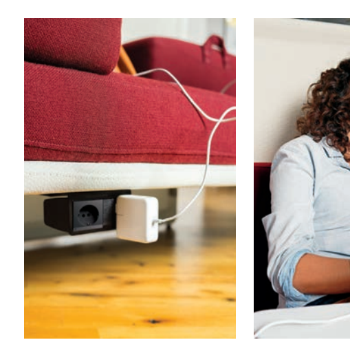
Seating and tables are equipped with built-in power to keep devices charged all day.

The articulating cushion toggles to support a range of work modes. Lean back for casual work. Lean forward for greater focus.