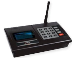
IStation Transmitter Pager Alerts Only (Optional)