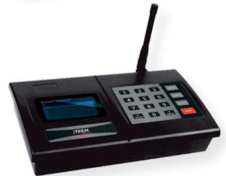
IStation Integrated Transmitter