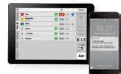
Waitlist & Messenger