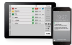
Waitlist & Messenger