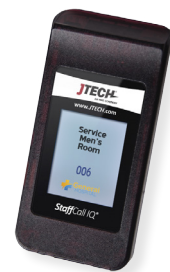
Door Alert System Transmitter & Pager