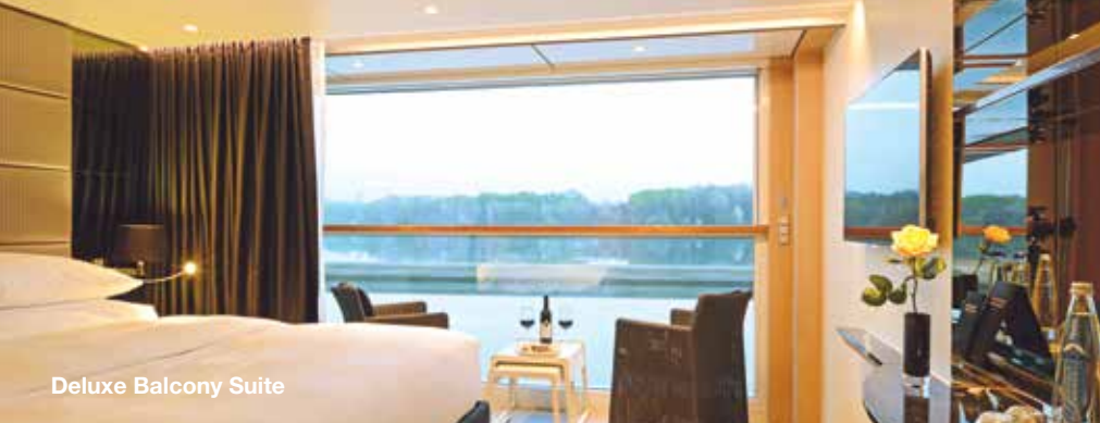
Deluxe Balcony Suite