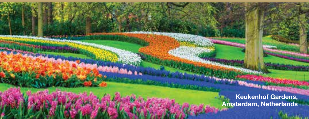
Keukenhof Gardens, Amsterdam, Netherlands

No credit card is required at cruise check-in, and Scenic's River Cruise Guarantee insures against unforeseen disruptions during your cruise.