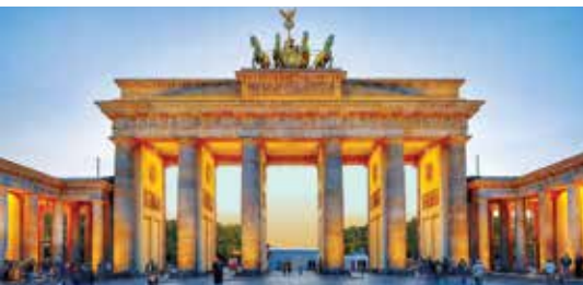
Venture through Berlin's majestic Brandenburg Gate.