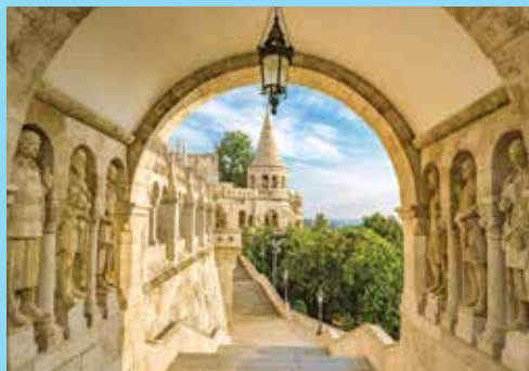
Enjoy your visit to the Fisherman's Bastion.

Visit the Romanesque, 14 th -century Cathedral of St. Martin and the elaborate Primatial Palace; see St. Michael's Gate, Bratislava's oldest preserved medieval fortification, originally built in 1300. This evening, enjoy a delightful performance of classical music on board the ship.