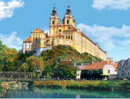
Visit beautiful Melk Abbey, founded in 1089, a former palace, and today a museum and center for learning.

RESPONSIBILITY: Gohagan & Company, the sponsoring associations/ organizations, and its and their employees, shareholders, subsidiaries, affiliates, officers, directors or trustees, successors, and assigns (collectively "Gohagan"), do not own or operate any entity which is to or does provide goods or services for your trip including, for example, lodging facilities, airline, vessel, or other transportation companies, guides or guide services, local ground operators, providers or organizers of optional excursions, food service or entertainment providers, etc. All such persons and entities are independent contractors. As a result, Gohagan is not liable for any negligent or willful act or failure to act of any such person or entity or of any other third party.