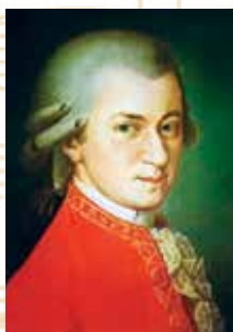
Wolfgang Amadeus Mozart

Since the 18 th century, the lands encompassing the Danube River Valley—Austria, Hungary and Germany—and the Czech Republic have bequeathed to the world an unparalleled musical legacy.