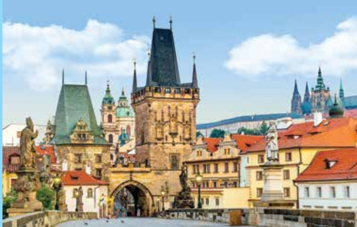
Admire the Charles Bridge and its Baroque statues, the lively streets of Prague's Old Town, or Stare Mesto, then watch the medieval Astronomical Clock.

Visit the Romanesque, 14 th -century Cathedral of St. Martin and the elaborate Primatial Palace; see St. Michael's Gate, Bratislava's oldest preserved medieval fortification, originally built in 1300. This evening, enjoy a delightful performance of classical music on board the ship.