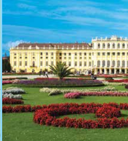
Choose to experience Rococo grandeur of Schönbrunn Palace, a UNESCO World Heritage site, an optional excursion.

A prestigious center of scholarship throughout the Middle Ages, today the abbey's library is a repository of 100,000 medieval manuscripts.