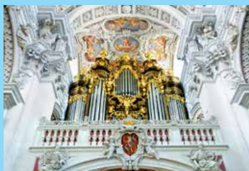
St. Stephan’s Cathedral organ is an acoustical marvel.

Embark the AMADEUS QUEEN, attend the Captain’s Welcome Reception and, following dinner, enjoy a short concert of classical music on board.