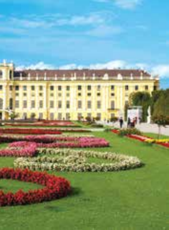
Hofbrunn Palace and Gardens, excursion.