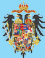
Habsburg Coat of Arms

U.S./Prague, Czech Republic Monday and Tuesday, September 16 and 17 Depart the U.S. for Prague, the “City of a Thousand Spires,” a UNESCO World Heritage site showcasing 600 years of