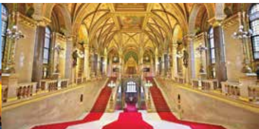
Tour the interior of the Budapest Parliament Building.

Known for its world-class museums and eclectic architecture, Berlin is one of Europe's preeminent cultural centers. Enjoy the city tour, cruise along the Spree River and visit the Wall Museum at Checkpoint Charlie, the former border crossing between East and West Berlin. Explore the Pergamon Museum on UNESCO World Heritage-designated Museum Island. En route to Prague, tour the "Jewel Box of Germany," Dresden, celebrated for its architecture and its cultural and artistic significance. Accommodations are for three nights in the deluxe WESTIN GRAND BERLIN HOTEL.