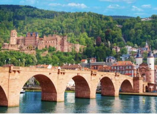
The romance of a bygone era still lives in Heidelberg, whose medieval castle rises above the Old Town and the 18 th -century Alte Brücke.