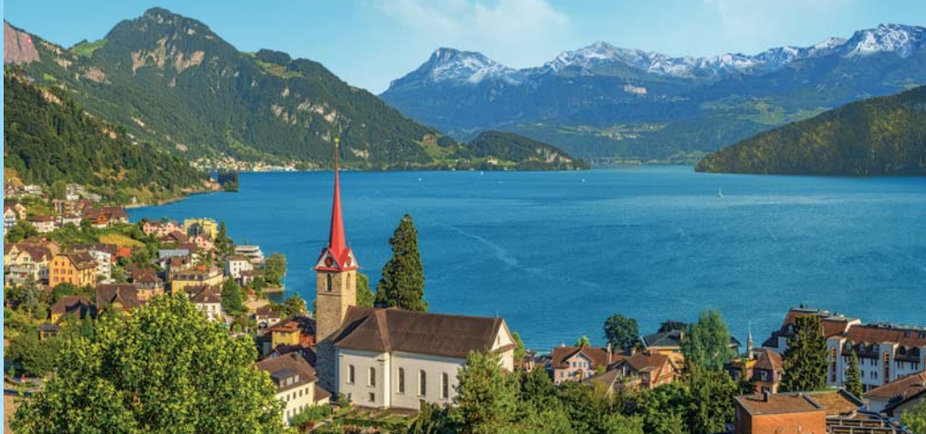
Cruise tranquil Lake Lucerne at the foot of Mount Pilatus and enjoy picturesque views of its fjord-like landscape and the four surrounding cantons of Lucerne, Schwyz, Unterwalden and Uri.

Reboard the ship and cruise through the pastoral Rheingau, Germany's most famous wine-growing region, known particularly for its Riesling.