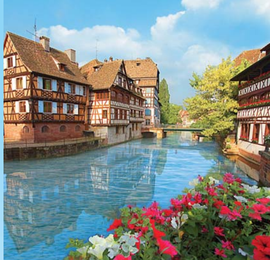
Half-timbered houses in Strasbourg's Petite-France quarter reflect the city's dual French and German character.

traveling from the soaring heights of the Alps to subtropical lowlands. Admire the impressive natural treasures of soaring, snowcapped mountain peaks, green, rolling hills, crystal-clear glacial lakes and densely wooded forests.