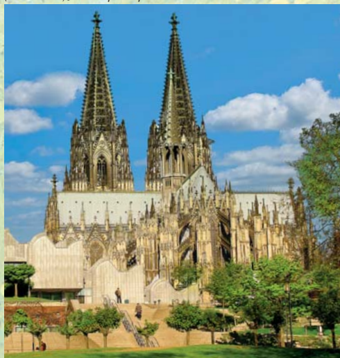
Towering spires crown Cologne's majestic Kölner Dom (cathedral), one of the finest Gothic structures ever built.

Following breakfast, disembark the ship and continue on the Golden Age of Amsterdam Post-Program Option or depart for the U.S.