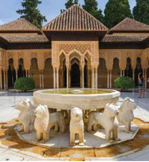
Tour the Court of the Lions, the main courtyard of the Nasrid dynasty Palace of the Lions, in the heart of the Alhambra.

RESPONSIBILITY: Gohagan & Company, the sponsoring associations/ organizations, and its and their employees, shareholders, subsidiaries, affiliates, officers, directors or trustees, successors, and assigns (collectively “Gohagan”), do not own or operate any entity which is to or does provide goods or services for your trip including, for example, lodging facilities, airline, vessel, or other transportation companies, guides or guide services, local ground operators, providers or organizers of optional excursions, food service or entertainment providers, etc. All such persons and entities are independent contractors. As a result, Gohagan is not liable for any negligent or willful act or failure to act of any such person or entity or of any other third party.