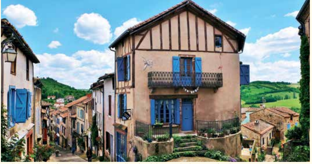
Stroll the quiet lanes of Cordes-sur-Ciel, a scenic village founded in 1222 by the Count of Toulouse.