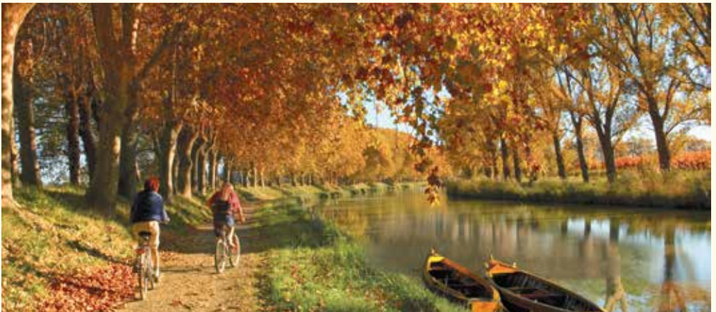
The historic Canal du Midi winds its way from Toulouse to the Mediterranean port of Sète, flowing through traditional French villages.

The 13 th -century hilltop village of Cordes-sur-Ciel appears to float above the sky, or sur ciel , among low-lying clouds that hang in the surrounding Cérou Valley.