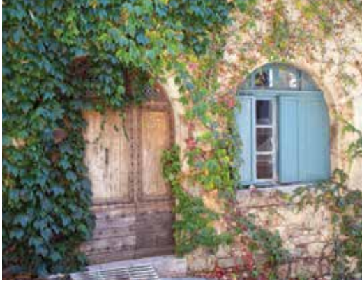
Seasonal ivy and foliage frame the centuries-old castles and churches tucked throughout the French countryside.

PRSR STD U.S. Postage PAID Gohagan & Company