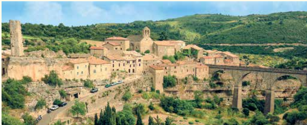
Considered one of the most beautiful villages in France, the hilltop village of Minerve is the historic capital of the Minervois region.

CULTURAL ENRICHMENT: Enjoy time on your own to explore the enchanting, medieval hillock of Minerve.