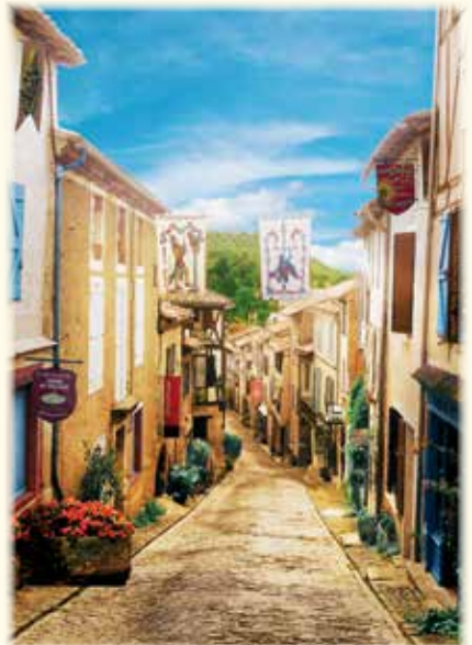
Cover: The fortified walls and cobblestone byways of medieval Carcassonne have remained intact since approximately 100 B.C.