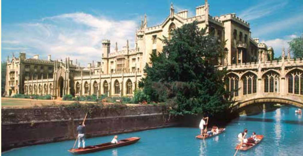
Punting along the serene River Cam through the idyllic College Backs is a treasured summer pastime in Cambridge.

proper attire and are still honored with a three-course meal and waiter service. Learn more about student life at Oxford as you walk the cobblestone squares, medieval alleyways and Renaissance quadrangles of the oldest university in the English-speaking world.