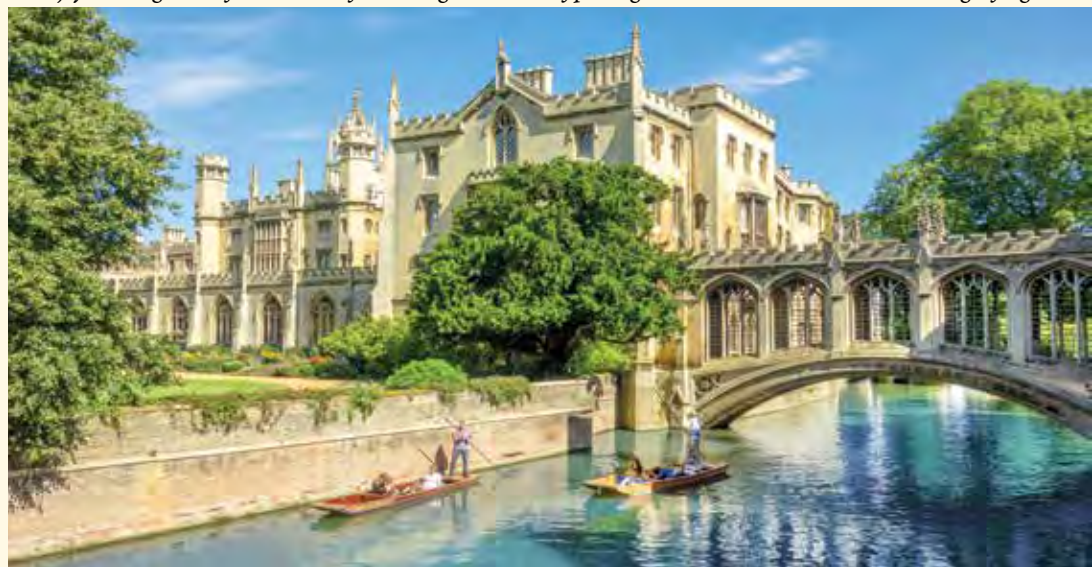
Enjoy stunning views of "the Backs" of Cambridge and scenes of punting on the River Cam and under the Bridge of Sighs.

Remarkable Highclere Castle, featured in the acclaimed PBS Masterpiece series Downton Abbey , is set in an Edwardian-period property among 1000 acres of sprawling parklands, expertly landscaped by "England's greatest gardener," Lancelot "Capability" Brown. The richly decorated state rooms have been restored with authentic elements including embossed Spanish