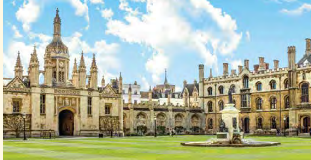
Admire the architecture of the main court of King's College, University of Cambridge.