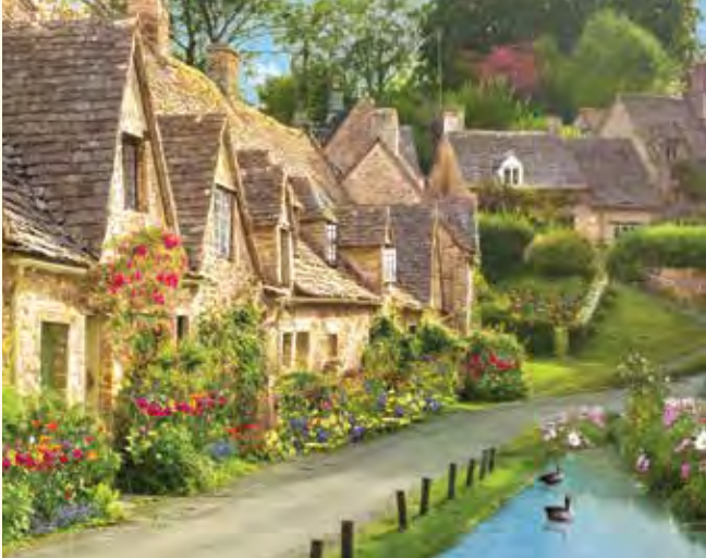
Delight in the old-world charm of the honey-colored weavers' cottages in Arlington Row, Bibury, nestled in the Cotswolds.

leather wall coverings, Italian embroideries, silk bed hangings and 400 years' worth of paintings and furniture, including a mahogany desk and chair that once belonged to Napoleon.