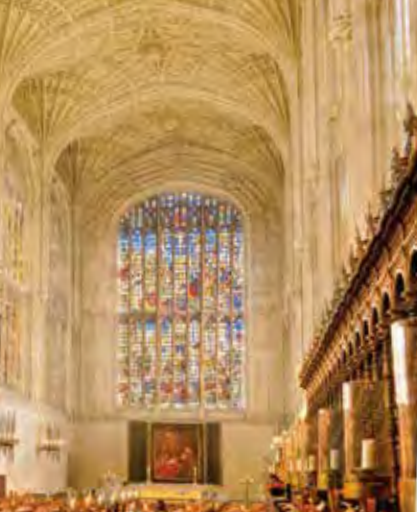
the world's largest fan vault ceiling within a single nave chapel.