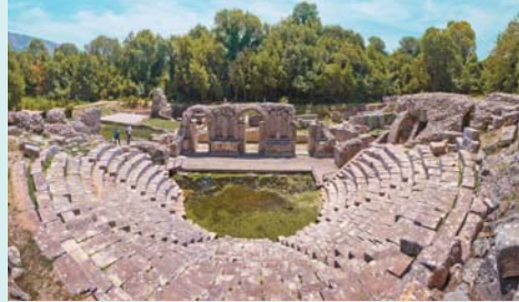
Butrint's 3000-year-old archaeological ruins are a UNESCO World Heritage site.