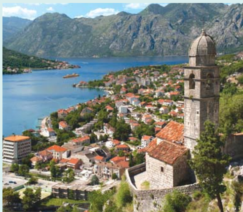
Dock in Montenegro's stunning Bay of Kotor, a fjord-like natural harbor.