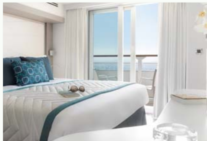
Stateroom with Balcony

Each air-conditioned, deluxe Stateroom and Suite (200 to 592 square feet) features a private bathroom with shower, luxurious Five-Star hotel amenities and minibar with complimentary beverages; most have two twin beds that convert into one queen bed. Enjoy accommodation amenities including individual climate control, satellite flat-screen television, wireless Internet access, safe, full-length closet, writing desk/dressing table, plush robes and slippers.