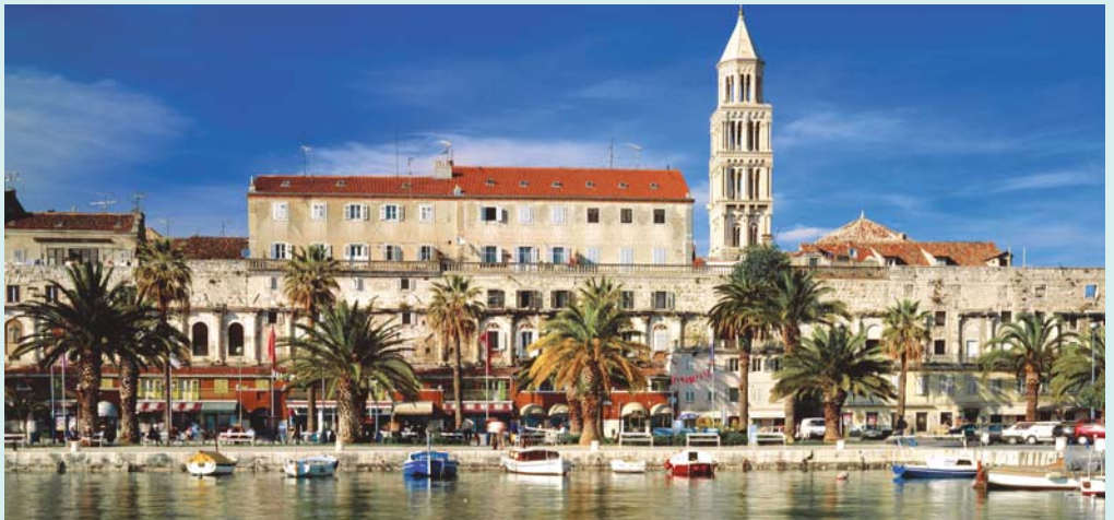
Seventeen centuries ago, Roman galleons anchored in the scenic harbor of Split and began construction of the ancient Roman Emperor Diocletian's Palace.