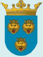
Dalmatia's medieval Coat of Arms

Experience firsthand the true character and traditions of coastal and island life along the Adriatic and Aegean Seas, among the world's most spectacular coastlines, and discover the lasting influence of Greco-Roman, Byzantine, Venetian and Slavic civilizations as you cruise through this charming, sun-kissed region. Enjoy an enriching travel experience like no other aboard the exclusively chartered, Five-Star small ship M.S. LE LYRIAL, featuring elegant accommodations and a specially designed included excursion in every port. Interact with local residents, explore the ancient civilizations, history, culture, architecture and art—and unpack just once!