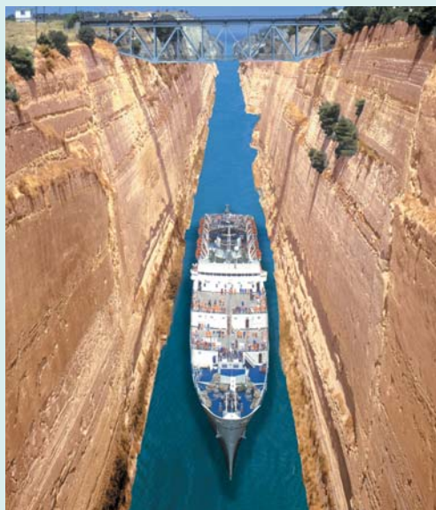
Be on deck to cruise through the Corinth Canal—only 70 feet wide at its narrowest point—a passage only small ships can navigate.

During the exclusive COASTAL LIFE FORUM®, local residents will discuss contemporary life along the Adriatic.