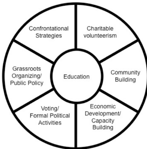
Figure 1: Social Change Wheel

Before proceeding with applications and case studies for service-learning education, analysis, and planning, the limitations of such a model ought to be acknowledged. First, these abstract categories may overlap conceptually or sequentially when applied to real situations. For example, public policy is sometimes formulated within the context of grassroots organizing and shaped by lawmakers within formal political activities . Second, social change wheel categories could be further defined and elaborated. For example,