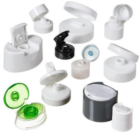
Flip, Disc, Valve, Bi-Injection