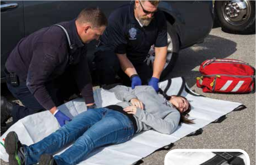
Available with PowerGrips®