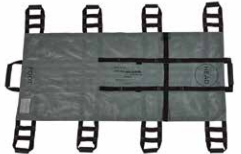
MegaMover® Disaster Response