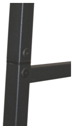
Bunks bolt together