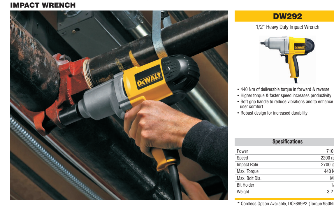
* Cordless Option Available, DCF620NT-XJ