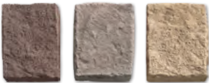
Espresso Grey Cream

StoneCraft accessories are designed to provide the finishing touch to any stone veneer application. Developed specifically to work in concert with any of our profile colors, each accessory is offered in four versatile colors.