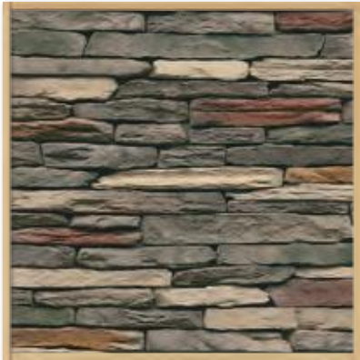
Tennessee Laurel Cavern Ledge