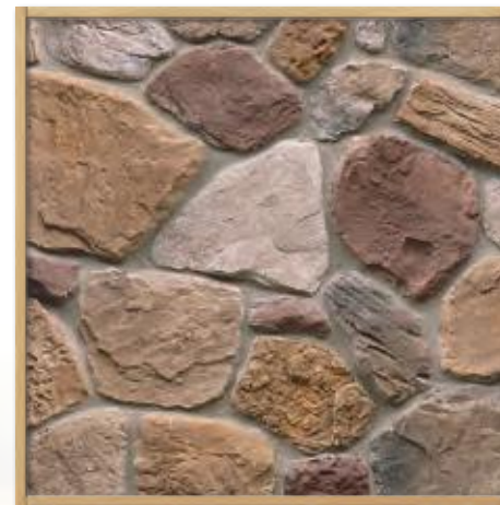
Realen Top Rock