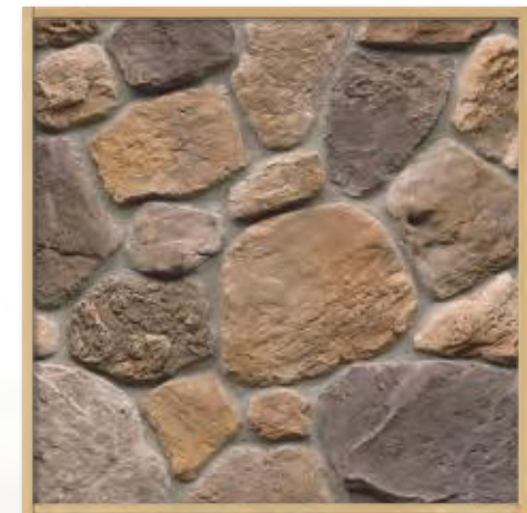
Warm Springs Top Rock