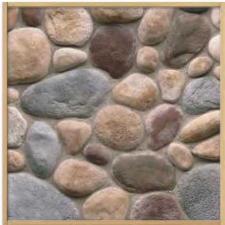
Adirondack River Rock

The distinctive and time honored shape of River Rock is easily recognizable. Soft rounded contours are slowly revealed from the gradual effects of rushing water. River Rock ranges in size from approximately 1½"–15" in height and 3"–18" in length.