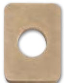
Light Box 8" w × 11" h × 1.5" d