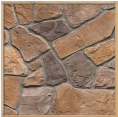
Warm Springs Fieldstone