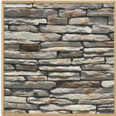
Hamilton Laurel Cavern Ledge