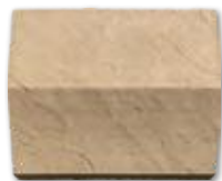
Peaked Wall Cap 20" L × 12" w × 2.375"-3.5" h 20" L × 16" w × 2"-3.5" h