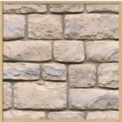
Old Ohio Heritage