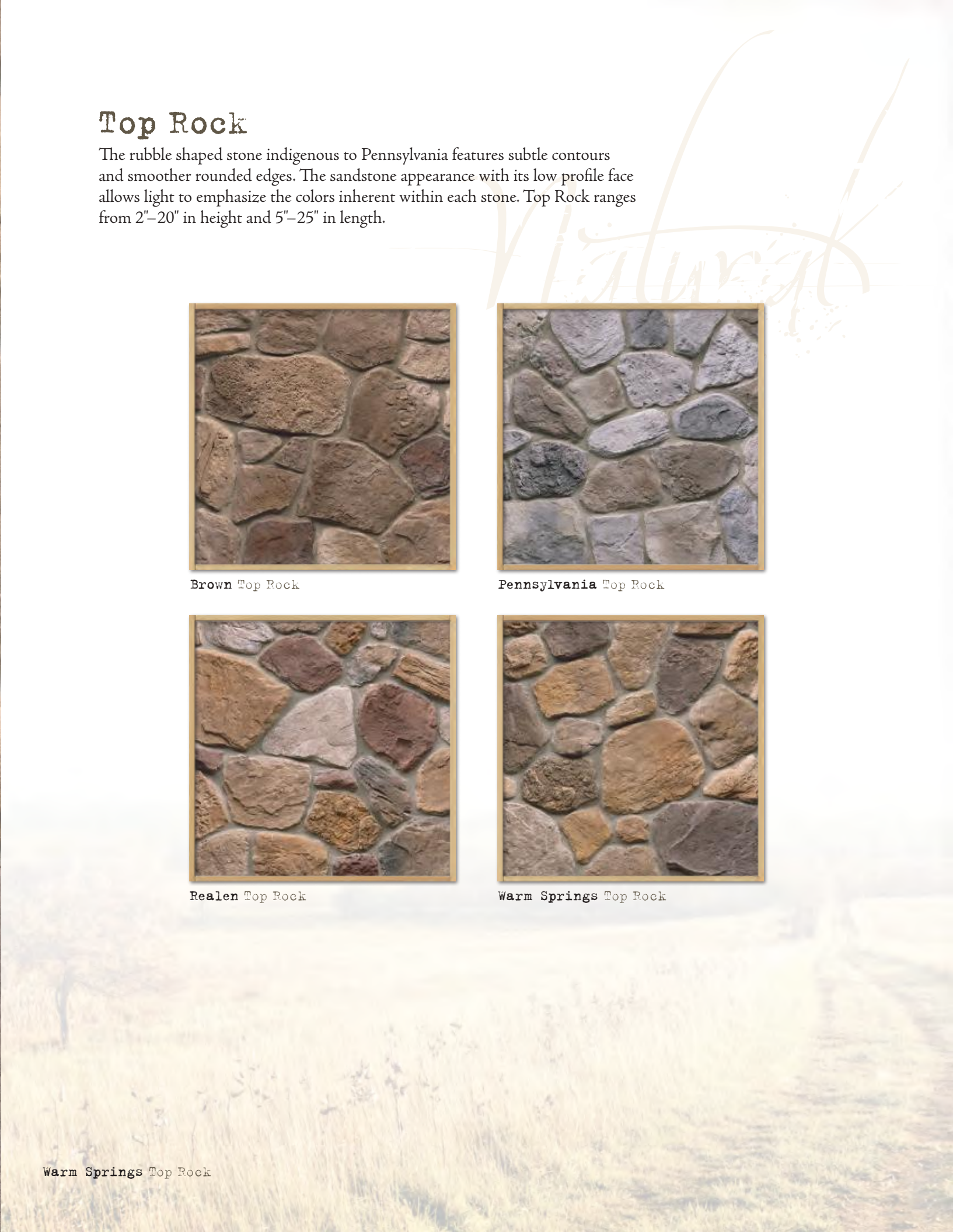
Warm Springs Top Rock