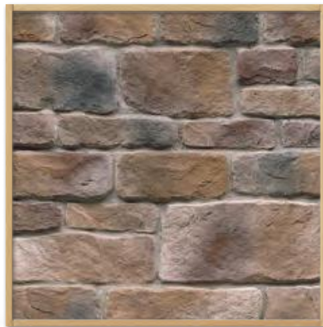
Valley Forge Cobble