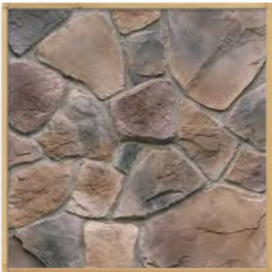
Valley Forge Fieldstone