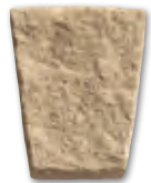
Keystone 8"-5.5" w × 10" h × 1.5" d