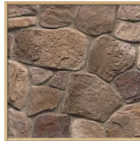
Brown Top Rock