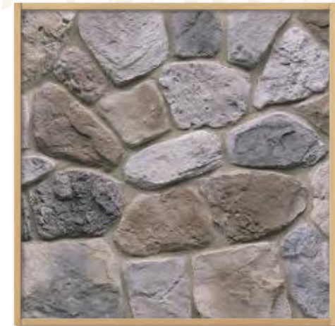
Pennsylvania Top Rock