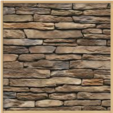
Asher Laurel Cavern Ledge