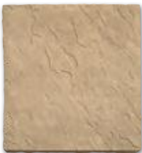
Hearthstone 19" w × 20" L × 1.5" h