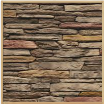
Chardonnay Laurel Cavern Ledge