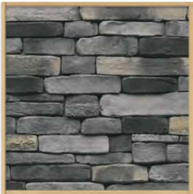
Kingsford Grey Ledgestone