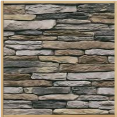
Pennsylvania Laurel Cavern Ledge