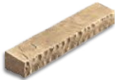
Rock Face Sill 19.75" w × 3" d × 2" h (FACE) TO 2.5" h (BACK)