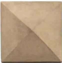
Pier Cap 26" w × 26" L × 2.5"-5.5" h