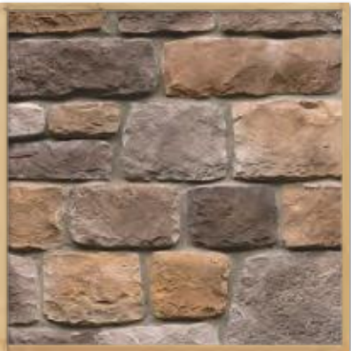
Warm Springs Heritage