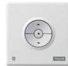
KLI 110 Remote