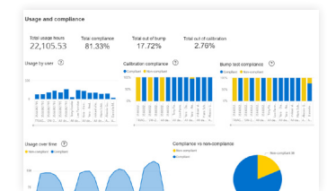
Blackline Analytics reporting platform