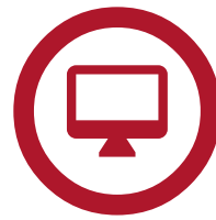
Blackline Live™ web portal