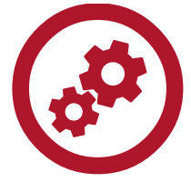
Easy inlet configuration