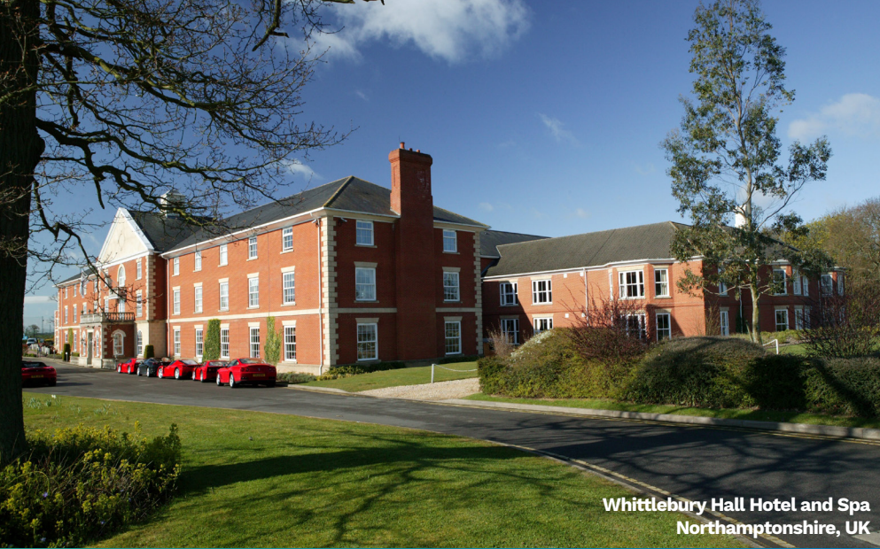
Whittlebury Hall Hotel and Spa Northamptonshire, UK