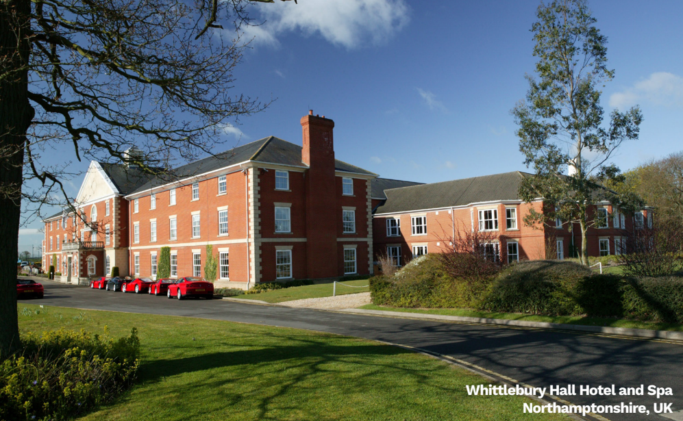
Whittlebury Hall Hotel and Spa Northamptonshire, UK