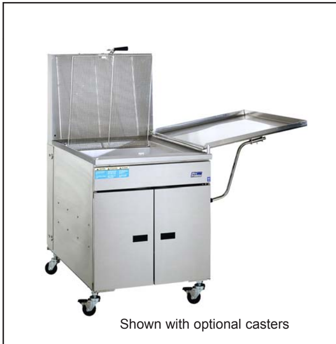
Shown with optional casters