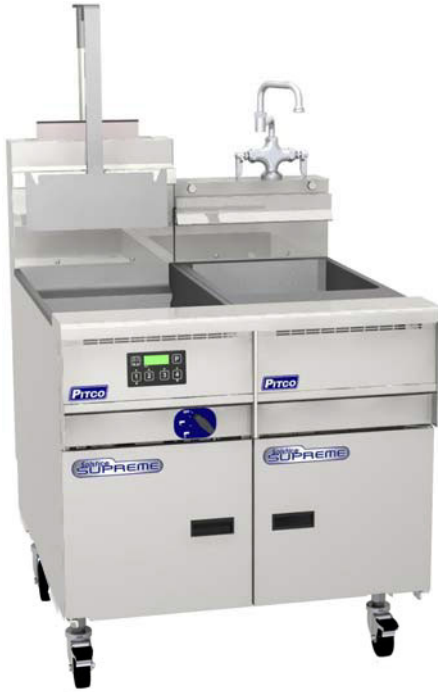
Shown with Optional Rinse Station Shown with optional: Casters, Single Basket Lift