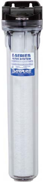
E20 Coarse Prefilter w/Cartridge-60190801.

Filters out larger contaminants and extends the life of the primary filters.