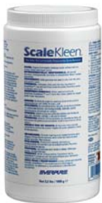
ScaleKleen Scale Remover (2.2lb)-60191201.

Unaffected by high temperatures, permitting a wide variety of applications