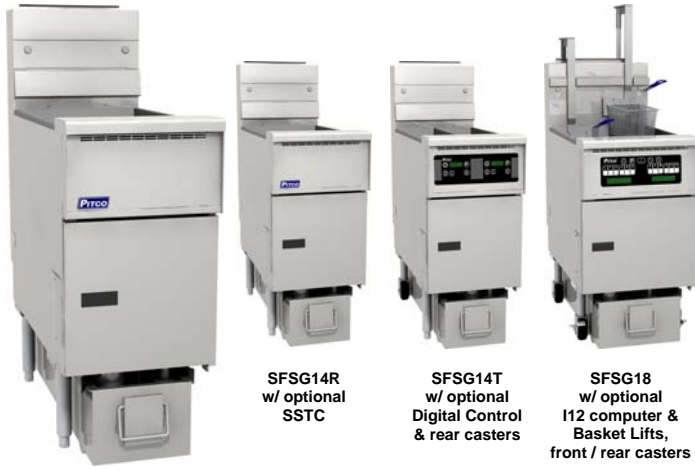
SFSG14 w/ standard Millivolt T-Stat

SOLOFILTER Solstice Gas (SFSG) Series SFSG14, 14R, 14T, 18 Fryer