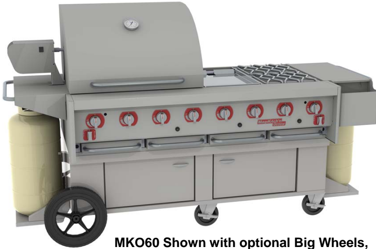
MKO60 Shown with optional Big Wheels, Rotisserie, Griddle, & Side Burners