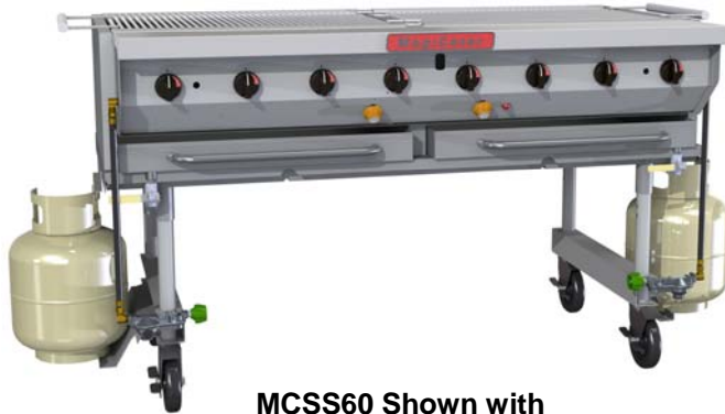
MCSS60 Shown with optional equipment