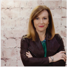
Theresa Payton President & CEO, Fortalice Solutions

Guest Keynote: IT Operations 2020 – Breaking all the Rules...How Should You React?