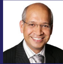
Milind Govekar Research VP, Gartner

8.00 AM - 9.00 AM | Orange Ballroom, Lower Level