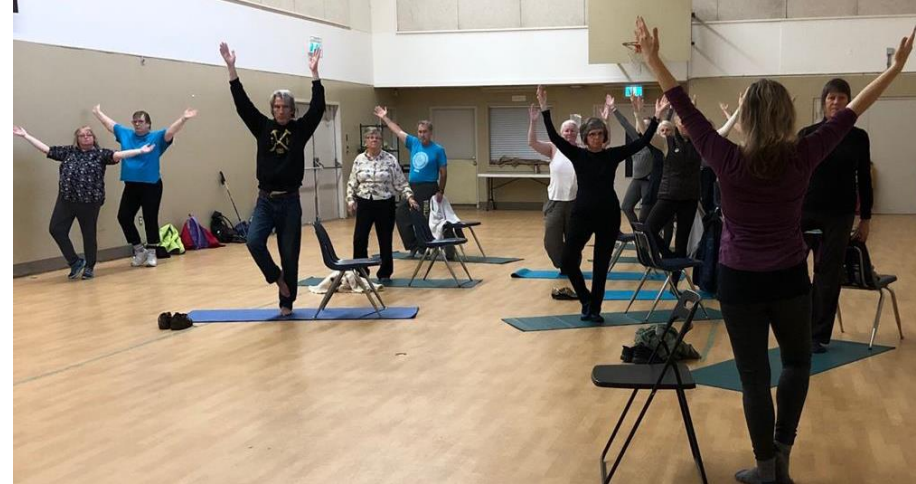
Co-op café workshop