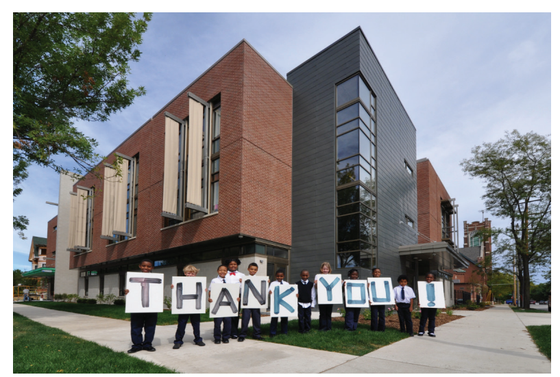
Primary grades building opened, 2011

Thank you for your partnership over fifteen years of growth.