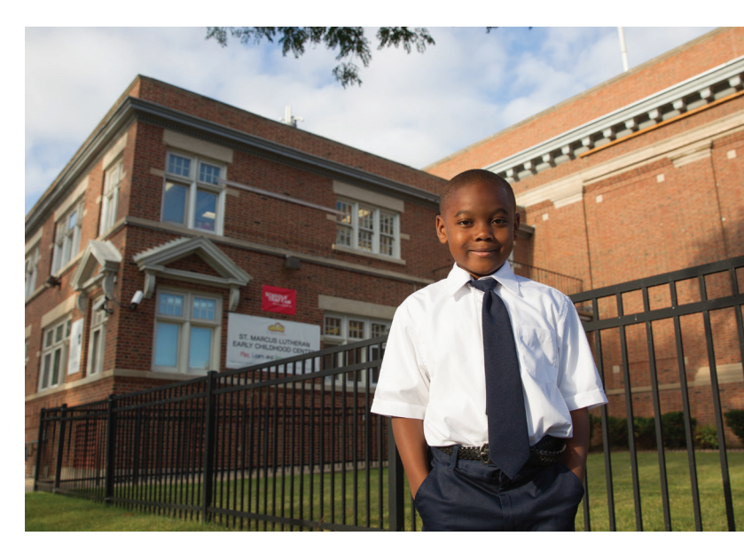
Above: Early Childhood Center (now North Campus) opens in 2014. Below: Expansion begins in 2015.

We seek to close out the capital portion of the Courage to Commit campaign ($1M), which will add four classrooms and provide paths for further expansion.