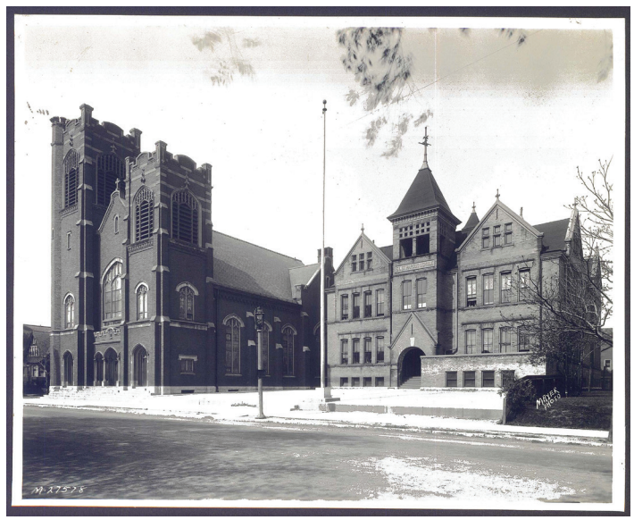
Original St. Marcus School building, torn down and rebuilt