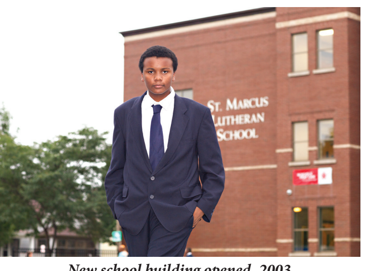
New school building opened, 2003