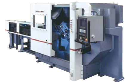
Bardons & Oliver also offers a CNC lathe (Model 36TBC) that turns, bores, faces, threads, profiles and cuts off automatically.

Machine . . . . .57" x 111" Electrical Box . . . . .36" x 36" Weight (approx.) . . . . .12,000 lbs.