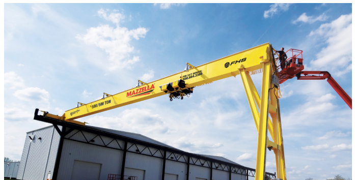
Semi-Gantry, Single Girder