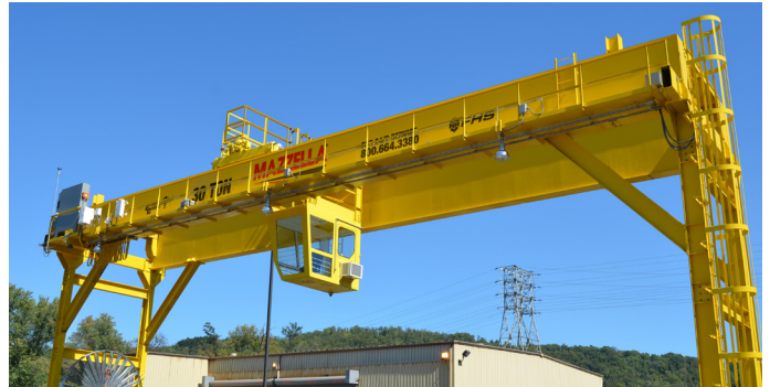
Full Gantry, Double Girder

Common uses for a full gantry or semi-gantry crane are heavy fabrication applications, or in some type of outdoor yard—rail yards, shipping and container yards, steel yards, and scrap yards. Portable and adjustable gantry cranes are often used to lift and hold an item in place while it is being worked on or to relocate heavy equipment and machinery.