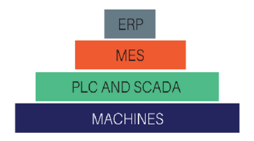
Basic 4.0 architecture foundations