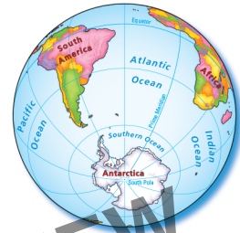
South Polar View