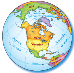
North Polar View