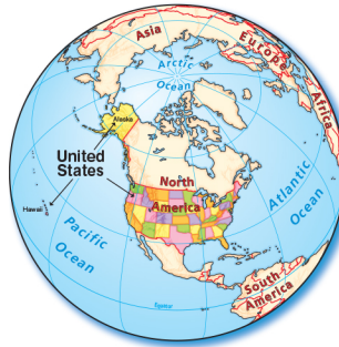
United States on a Globe