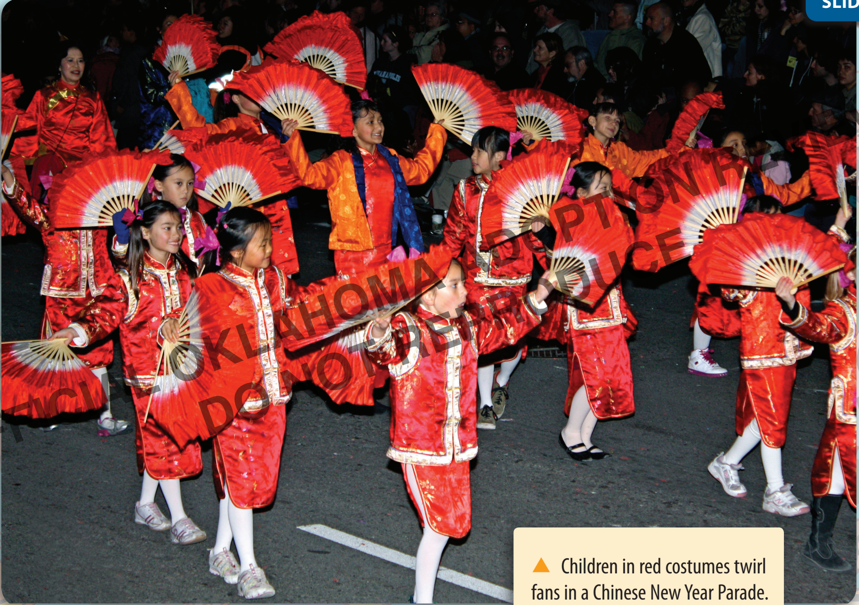
▲ Children in red costumes twirl fans in a Chinese New Year Parade.