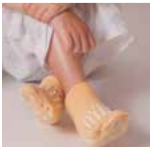
Confetti Treads 90215