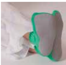
Safe-T Treads 80401