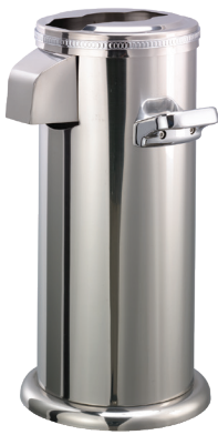
APC716BS Brushed Airpot Cover-Ups