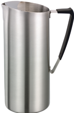
X7DWBS Stainless Slim Pitcher