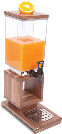
15S00011 Zepe Woodline Dispenser