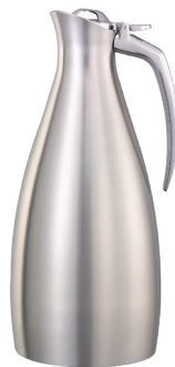
ALTU10BS Altus Carafe