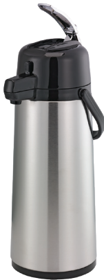
ECALS22S Eco-Air® Stainless Airpots