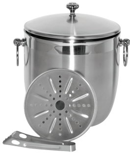
IB3BS Stainless Ice Bucket