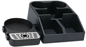
APC5 + APDT1BL Condiment Station & Airpot Drip Tray