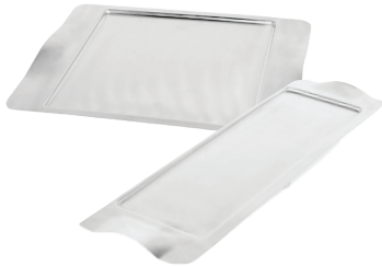
SB-41, SB-42, SB-43 Mod 18 Stainless Trays