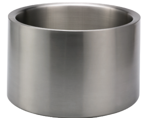
PT7BS Beverage Party Tub