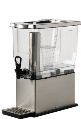
CBDT3SS Cold Beverage Dispenser