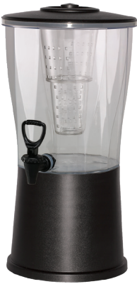
CBDRT3BL 3 Gallon Dispenser