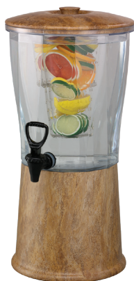
CBDRT3SSMB Cold Beverage Dispenser