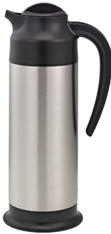
SSN100 SteelVac® Cream- ers