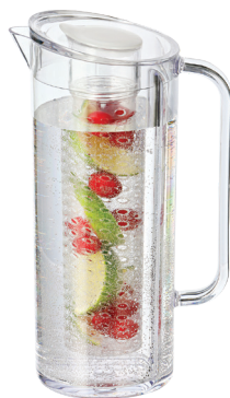
NEPH02-1 Flavor Infusion Pitcher