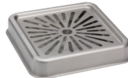
DTSQ6SS Square Drip Tray